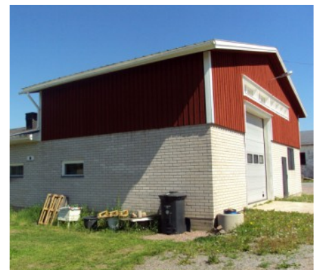
Finnish book storage

and thanked him for his work on the Swedish translation and for all his efforts since 1966 to spread the teachings of The Urantia Book in Finland.